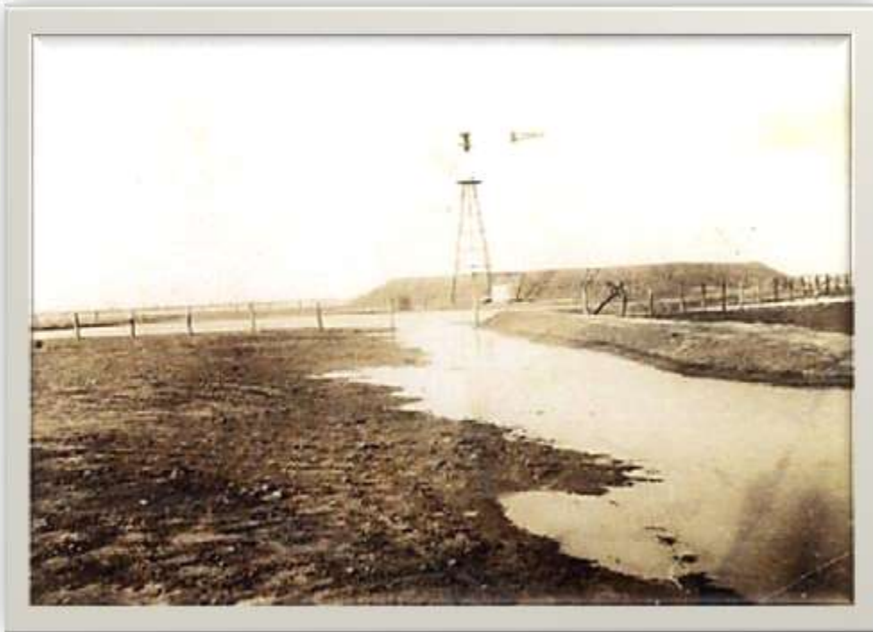
Number 5 bore.