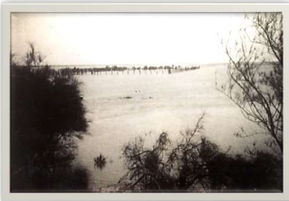
In 1949 ... 10 inches of rain fell overnight at Rockhampton Downs station.