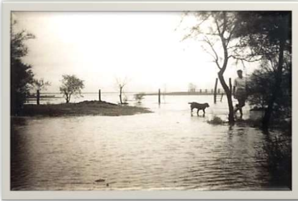
After rain taken from the homestead looking north west out across the plain (Ray Easey and his dog)