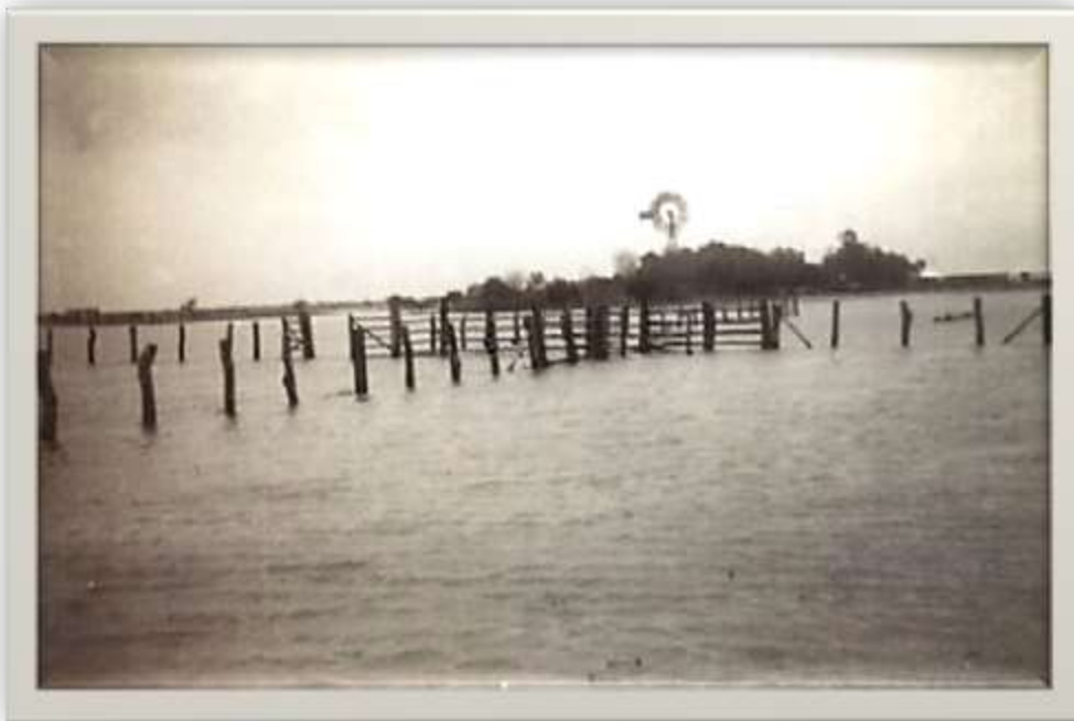
After rain taken from old stockyards looking east towards homestead